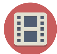
Video Editing (Basic)